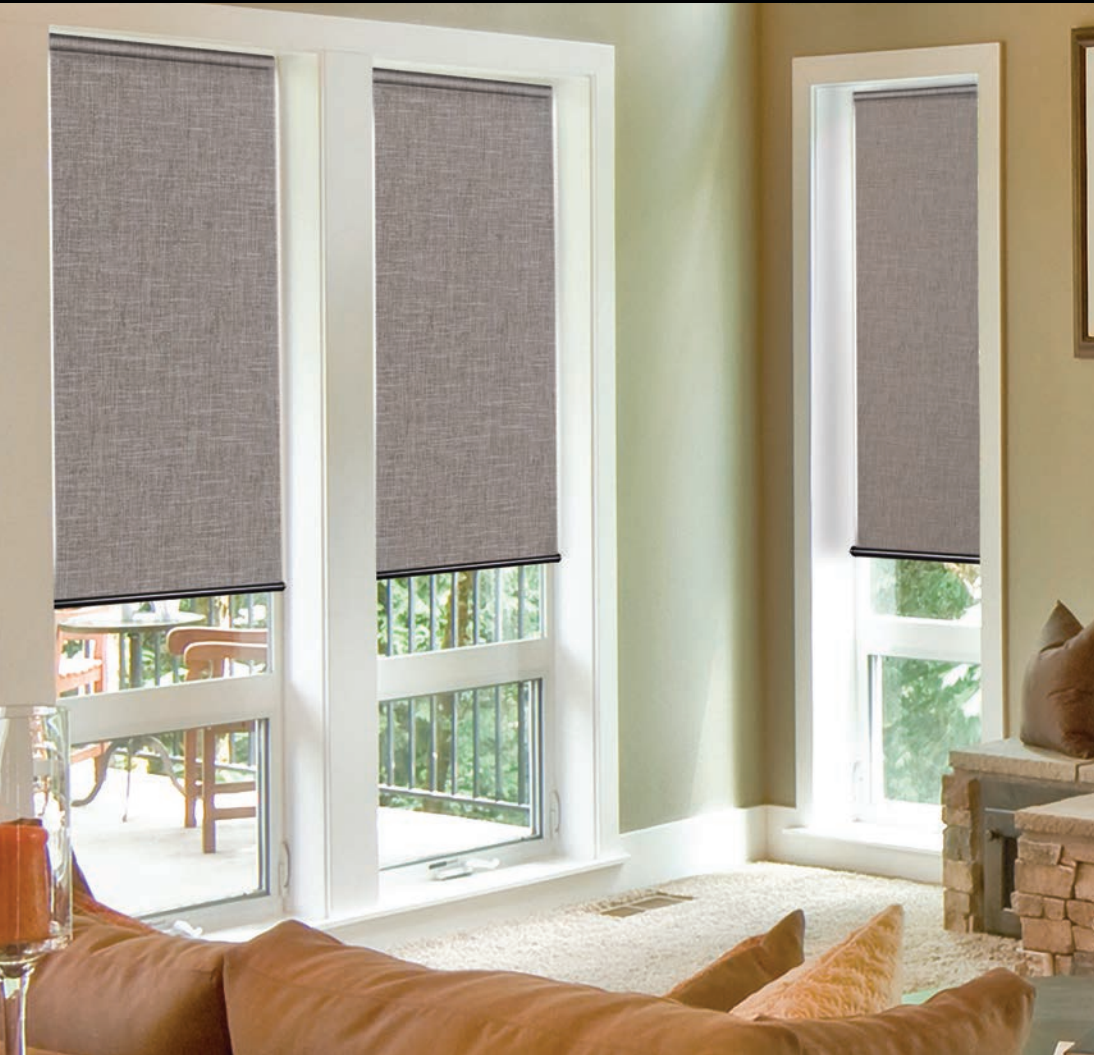
Vista shown above in Dune color

Conveniently order cut yardage (3 yard min.) in all colors and roll widths to make smaller jobs cost-effective