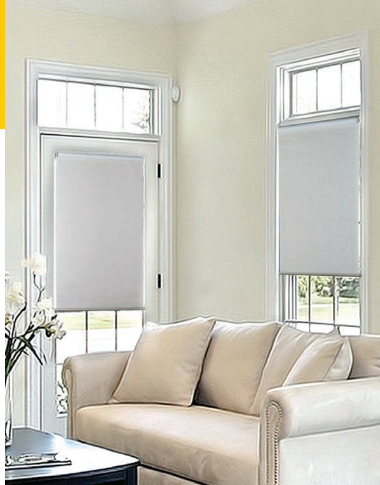
Vista shown above in Surf color