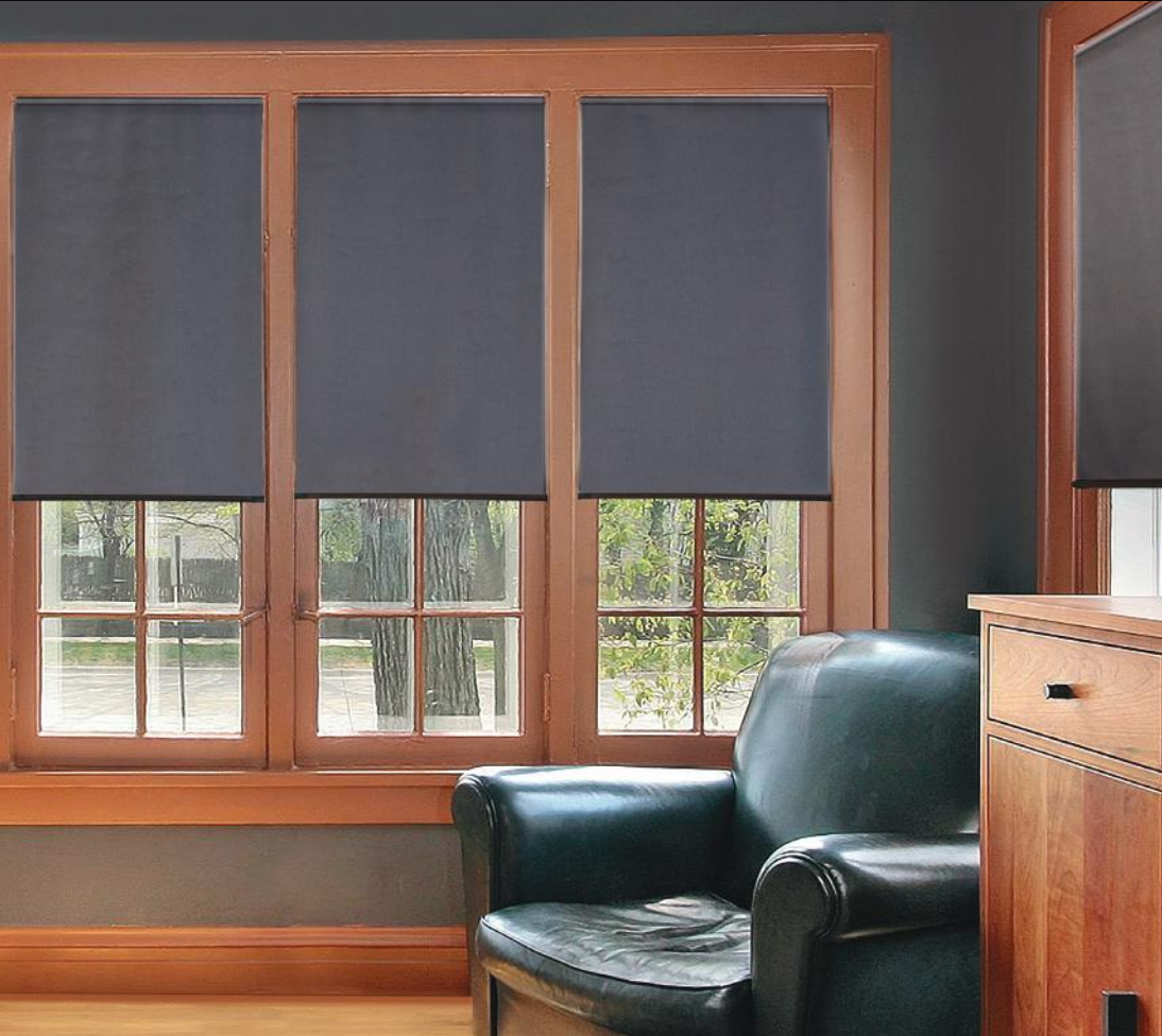
Mesa is shown above in the Slate color to accent the room's wall color and furnishings

M esa blackout fabric is ideal for a variety of applications that require total light blockage and privacy. Made from 100% polyester with an acrylic coating, Mesa is PVC-free, offering a high-quality, soft appearance that will add beauty to a room while reducing glare and solar heat gain.