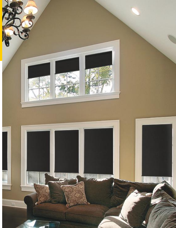
Mesa shown above in Cocoa color

Note: Custom color matching available. Contact RollEase for minimums and pricing.